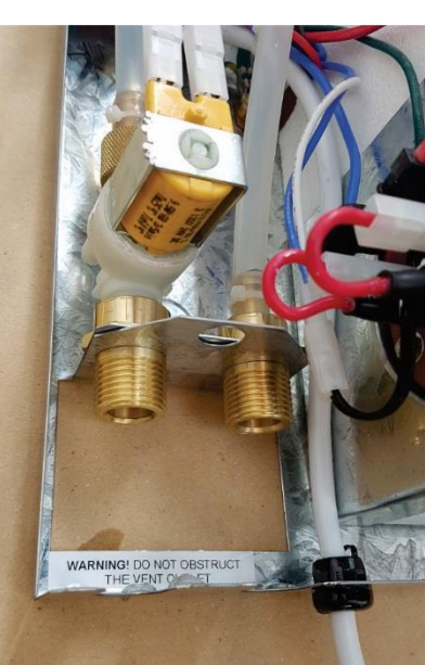
Fig 1 Fig 2 Fig 3