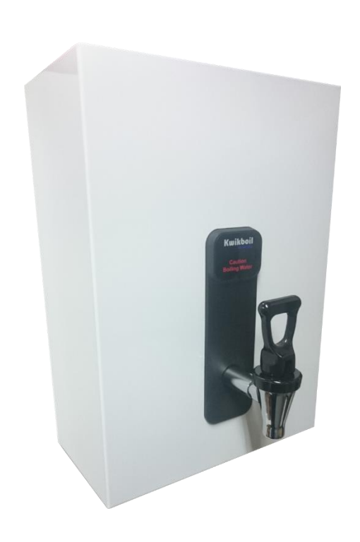
"M & S" Series Boiling Water Dispensers